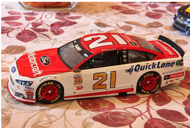
Ryan Blaney No. 21 NASCAR